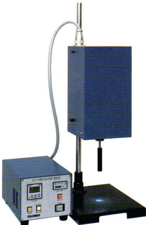
VERTICAL ILLUMINATION MODE